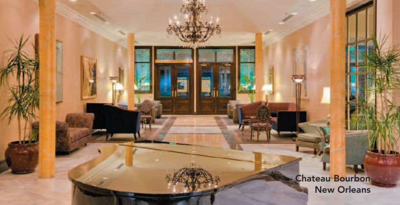
Chateau Bourbon New Orleans